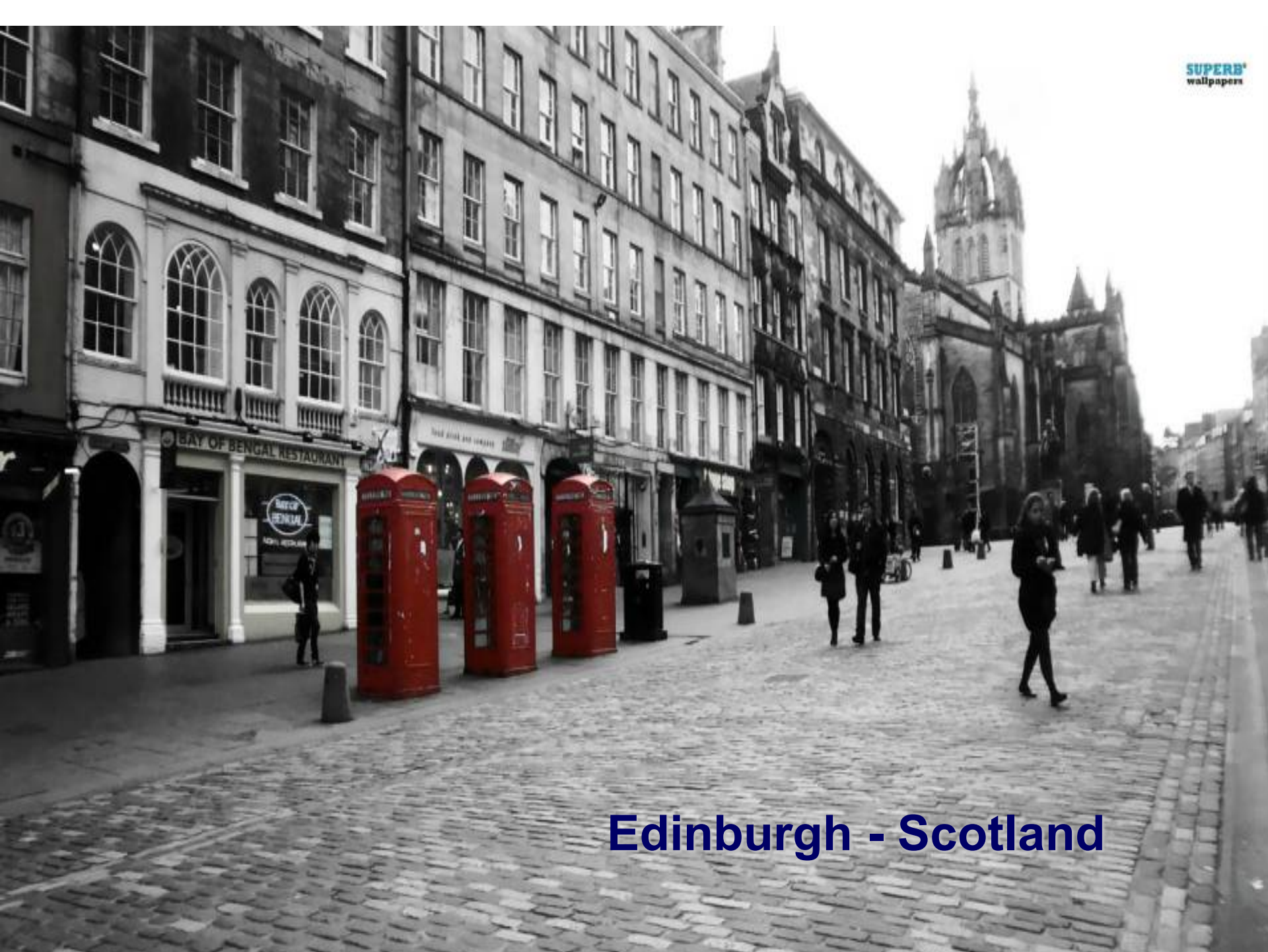
Edinburgh - Scotland