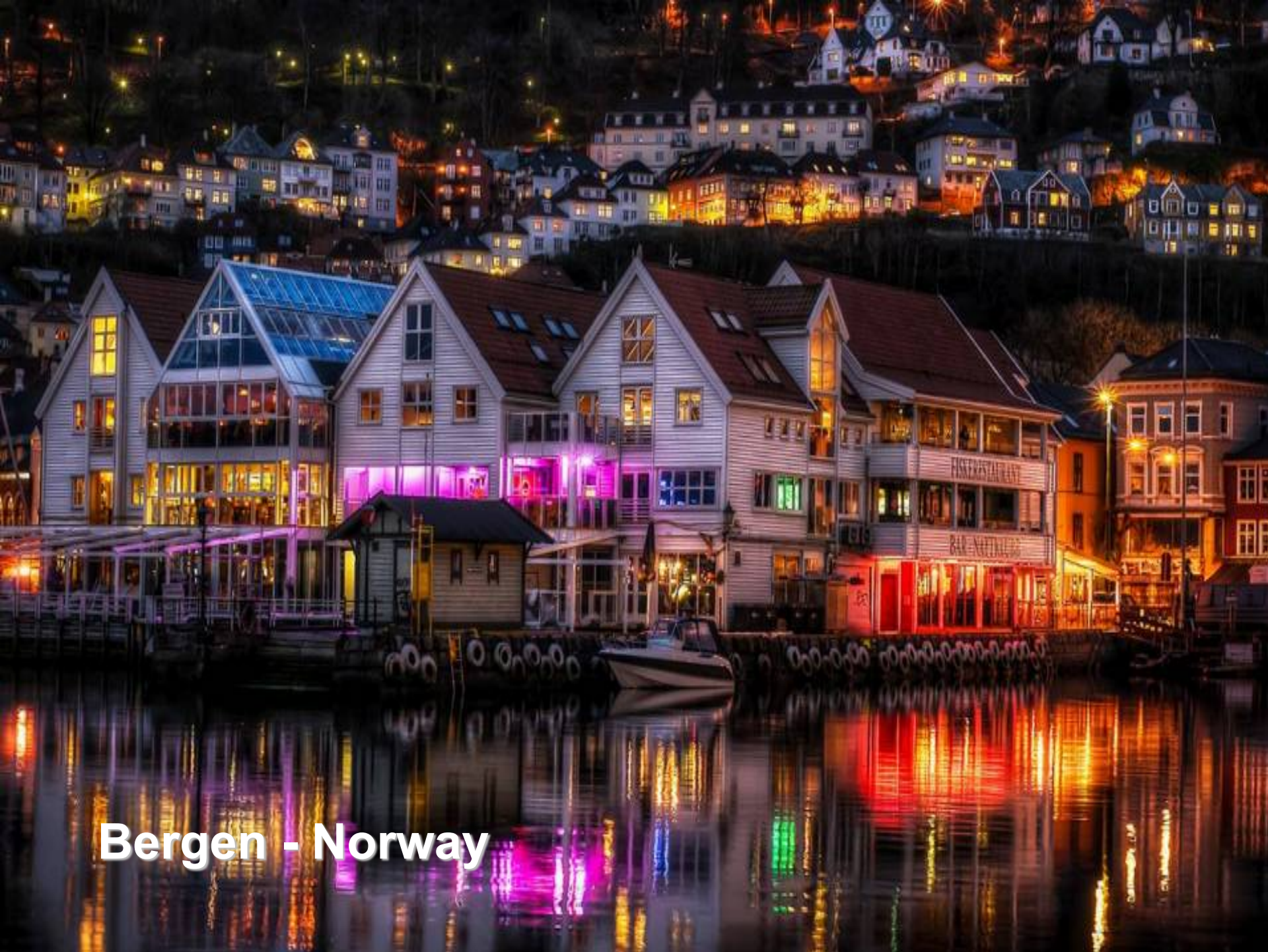
Bergen - Norway