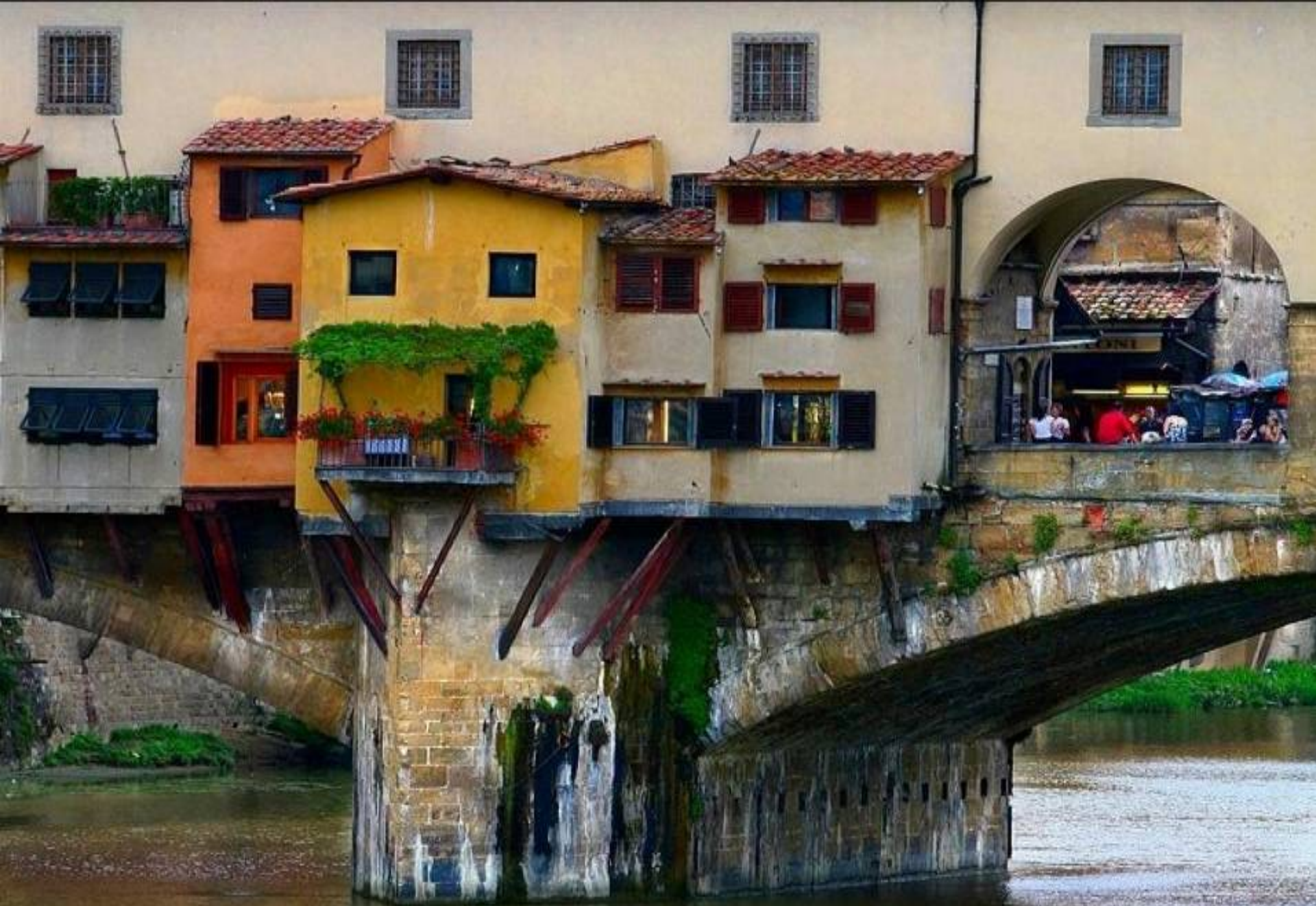
Montevecchio - Italy