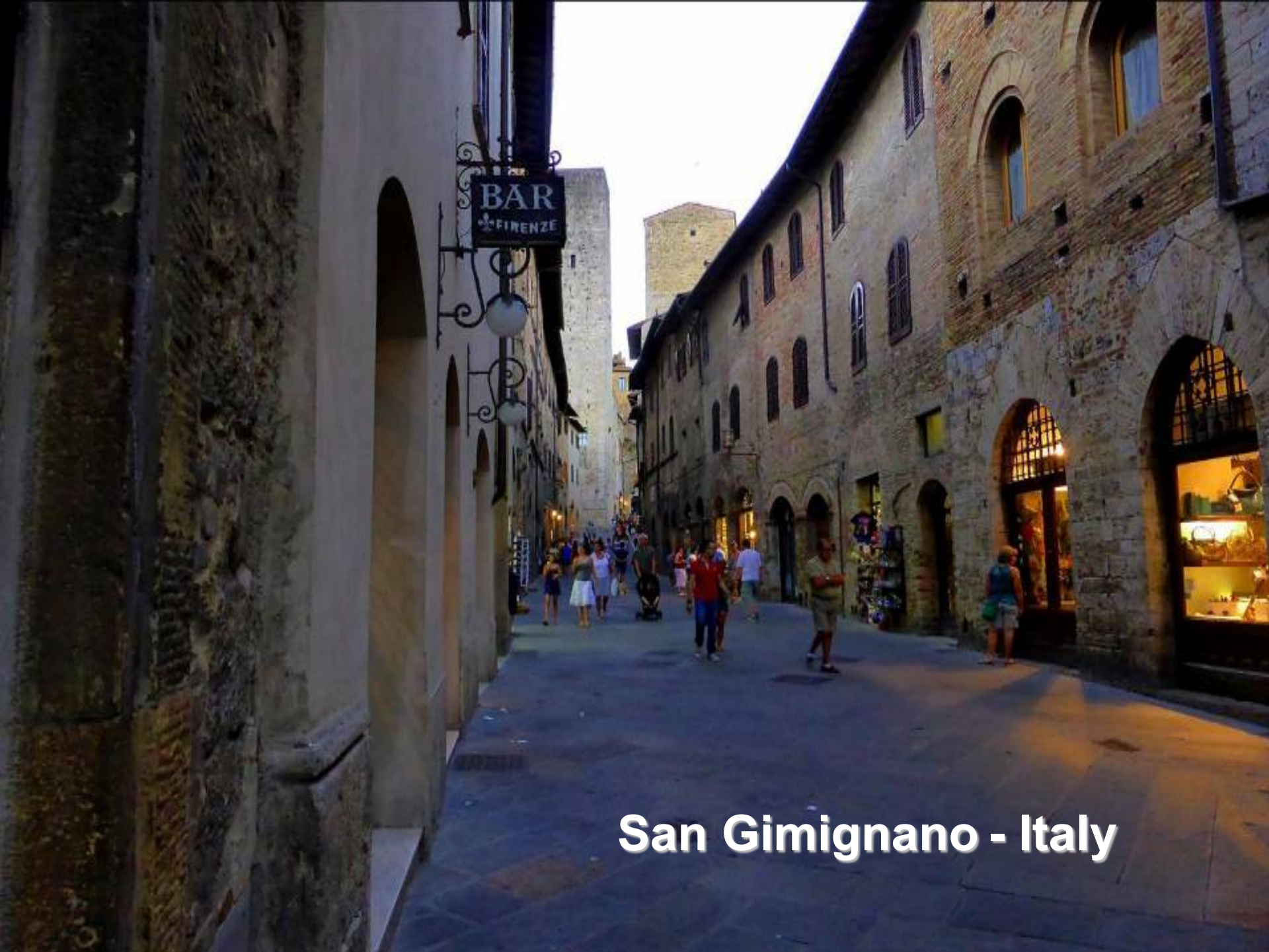
San Gimignano - Italy