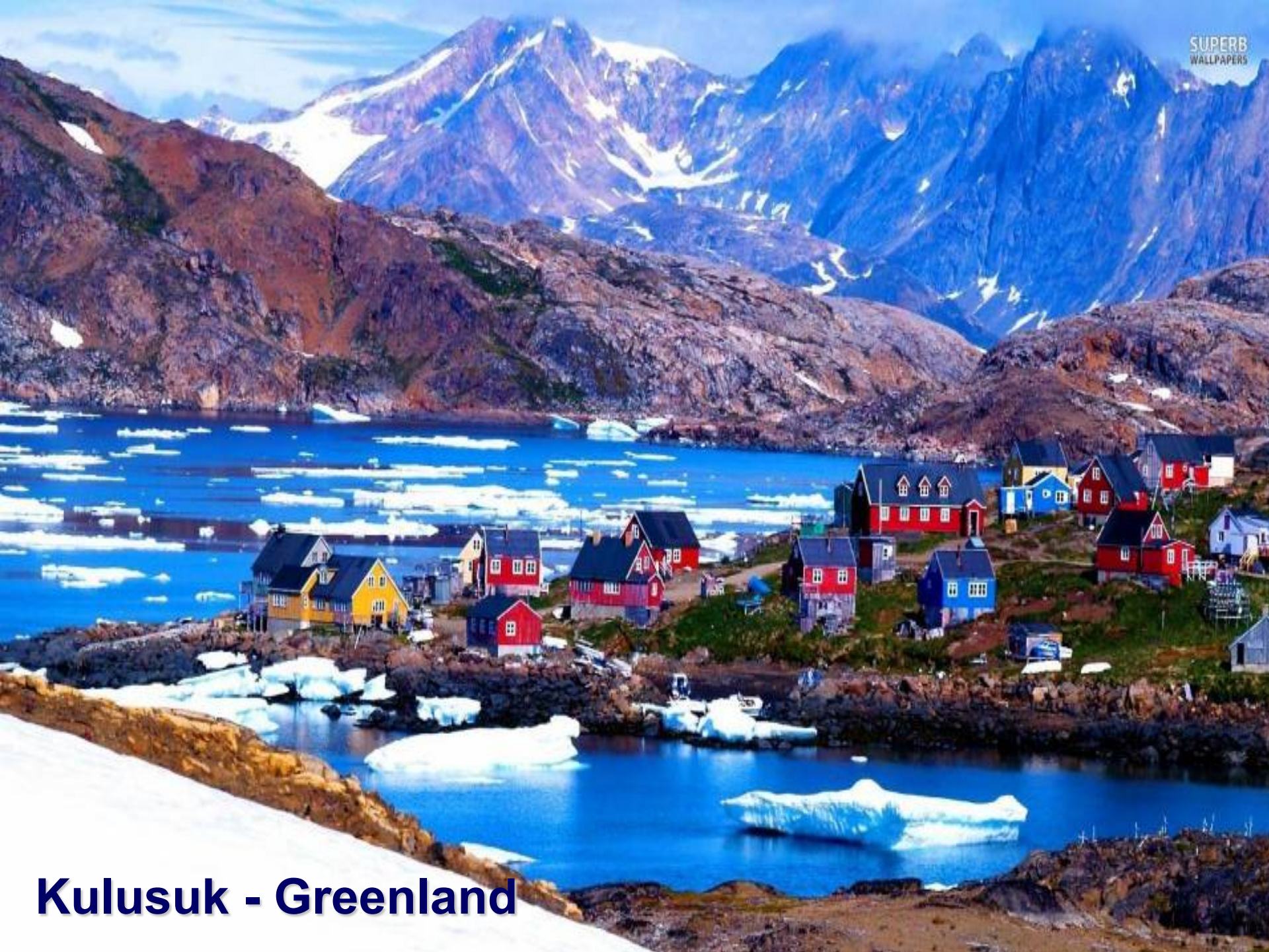
Kulusuk - Greenland