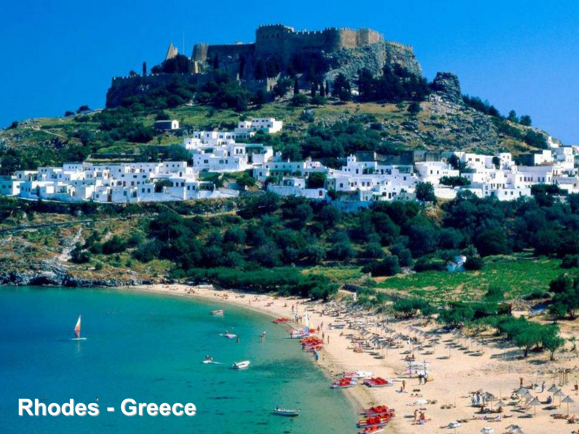
Rhodes - Greece