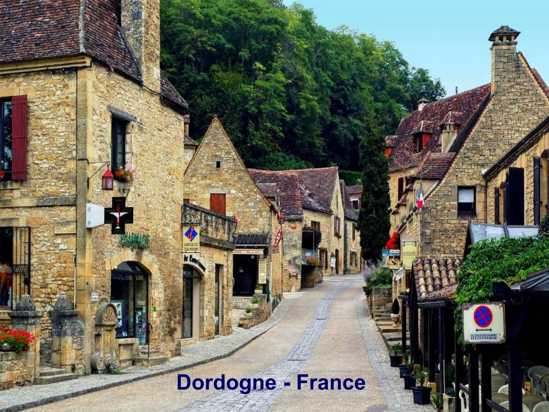
Dordogne - France