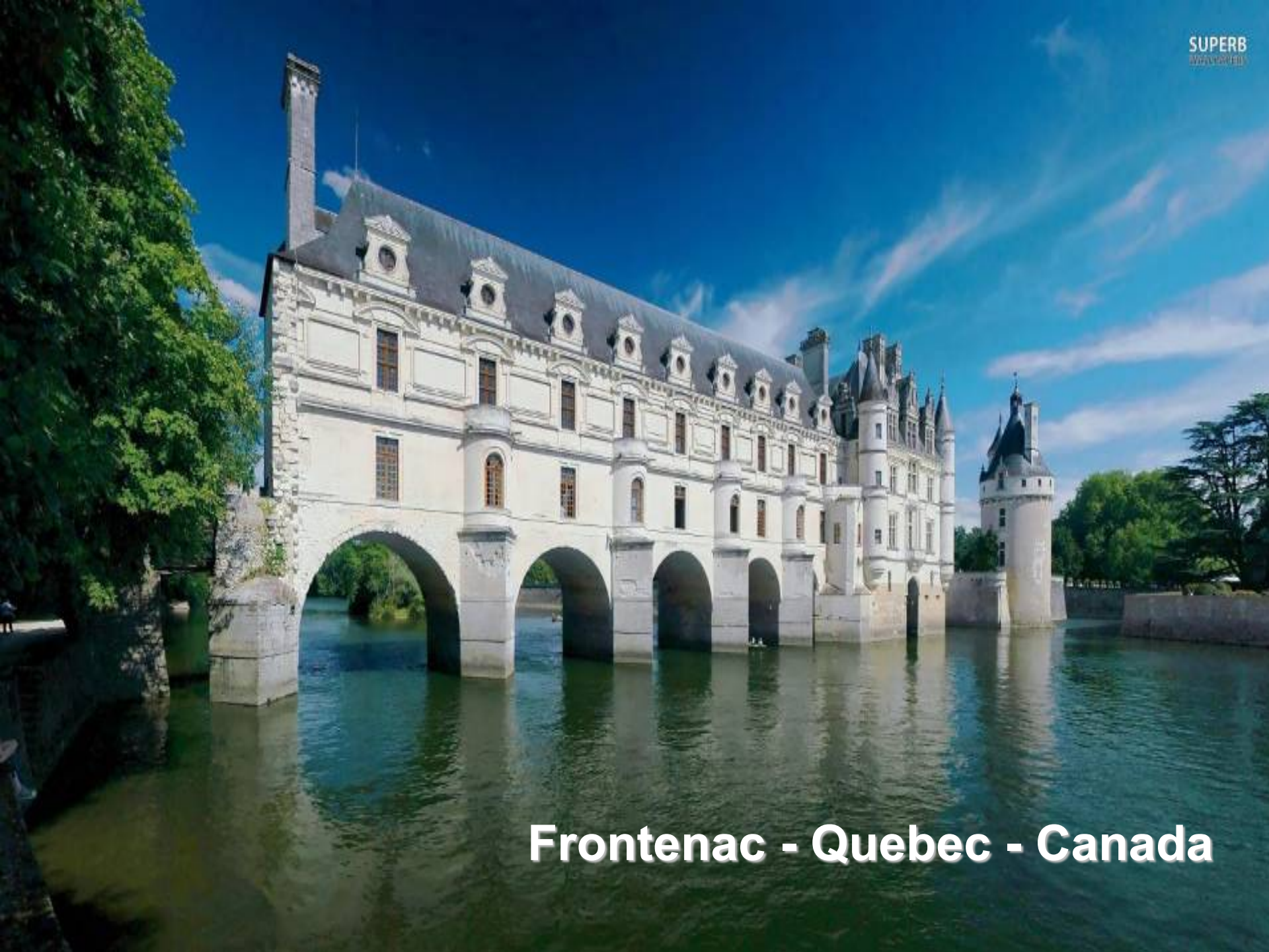
Frontenac - Quebec - Canada