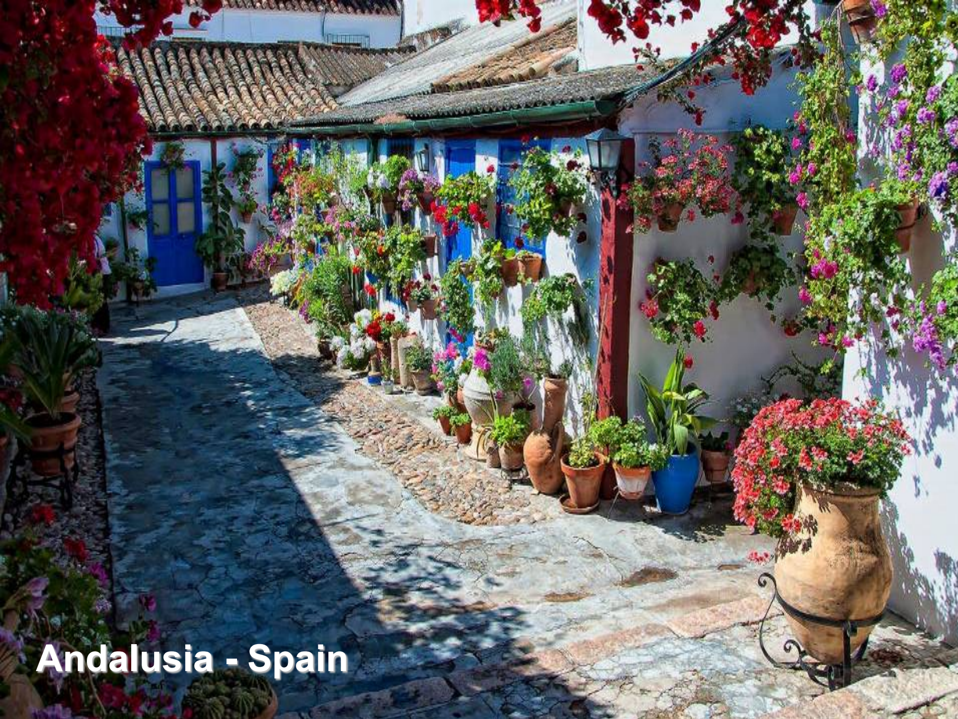
Andalusia - Spain