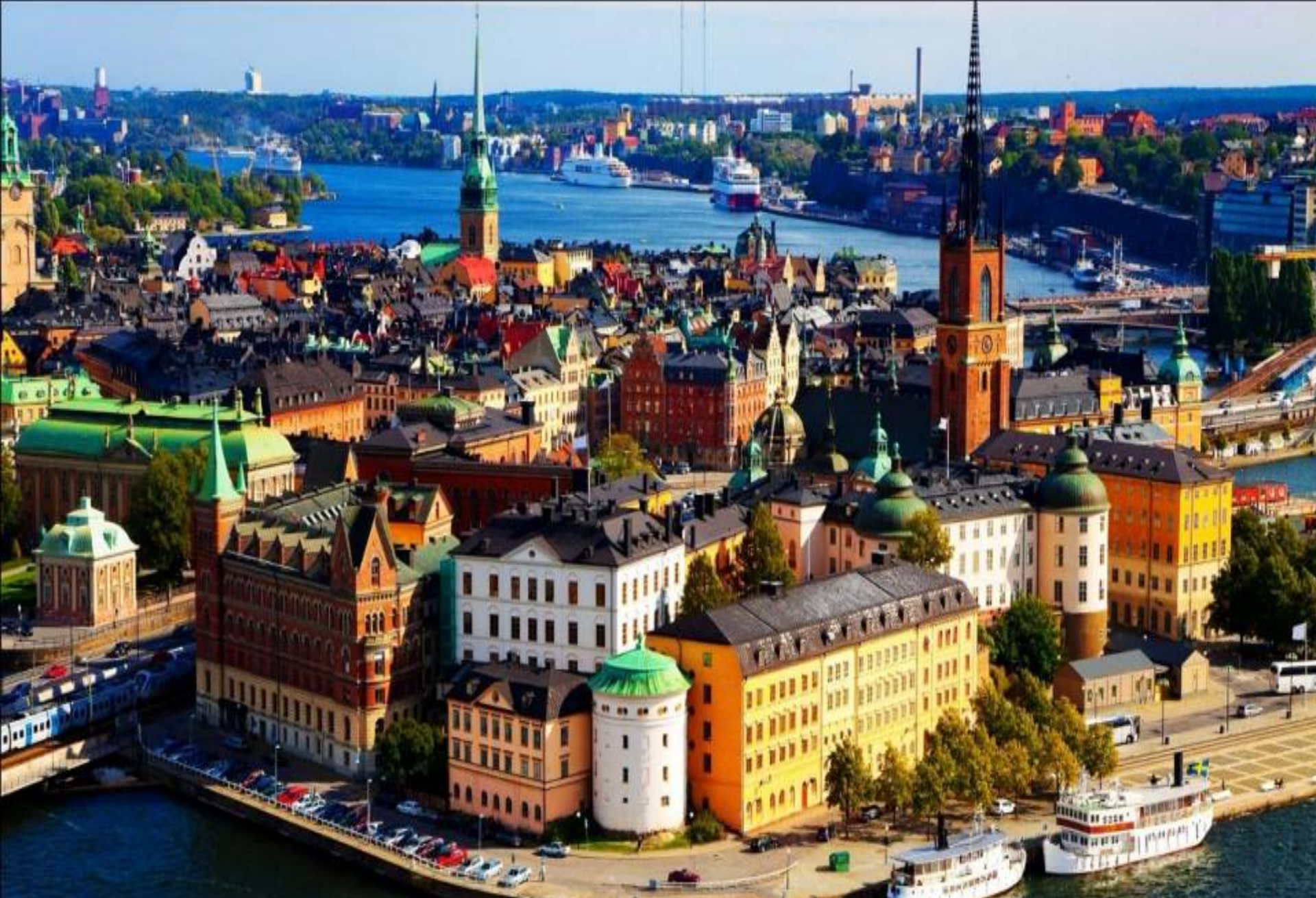
Stockholm - Sweden