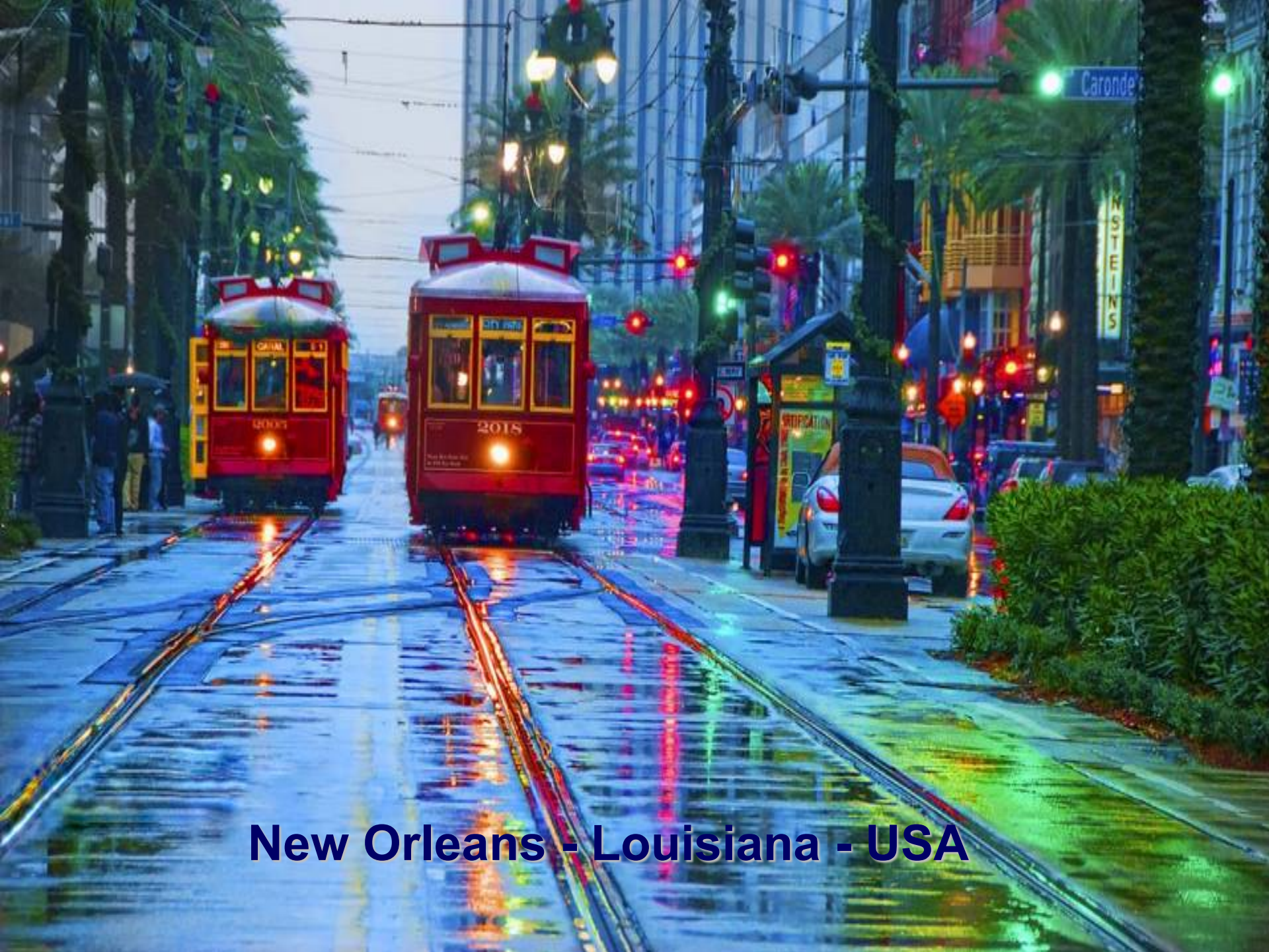
New Orleans - Louisiana - USA